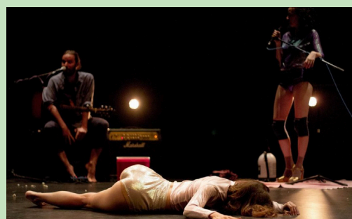
BITCH - Fundación Mis Bragas