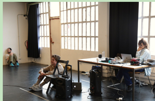
Cantus Gestualis - Ça marche