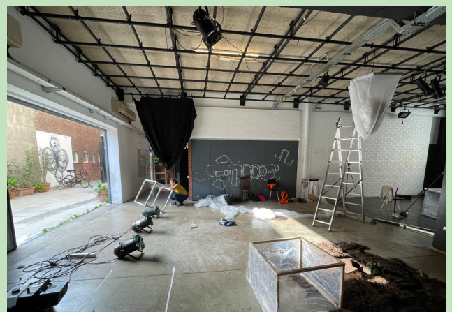
SOS - Ada Vilaró