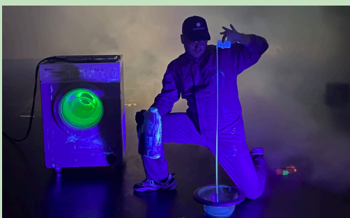
rentadora, gira mundial - Trashèdia AP-7