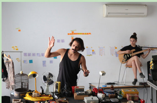
Només són coses - Hermanas Picohueso

The concept of resident is not only about financial aid in the production of a final "product". During the years of residency, the company will be accompanied by Nau, which will open up a gateway to international circuits, create synergies with other companies and groups, both local and from all over the world, and benefit from a more personalised assessment, not to mention other mentoring services. A direct relationship is also established with the territorial projects implemented by Nau.