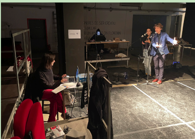
Lot 5/6 Pedra - Lo Nostro