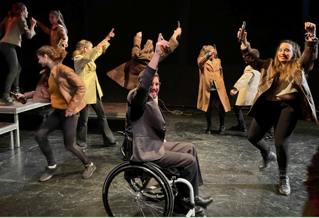
Antígona - Col legi del teatre