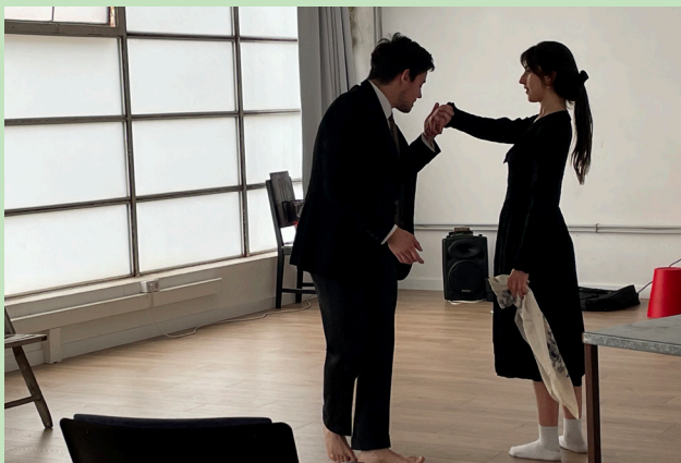
Un segundo bajo la arena - Desasosiego