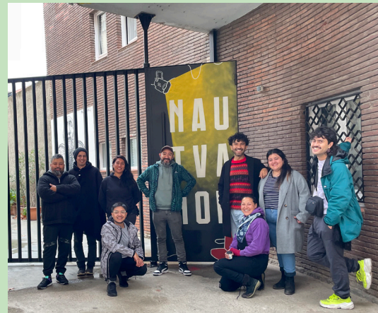
Teatro Puerto (Chile)