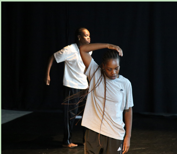
Les Mybalés (Belgique)

Like a stage for the general public, our objective is to walk hand-in-hand with professionals to help them find their feet in the world. Companies must decide their own future, but we, as a space, must offer them all the resources within our reach to ensure that there are no constraints on this decision.