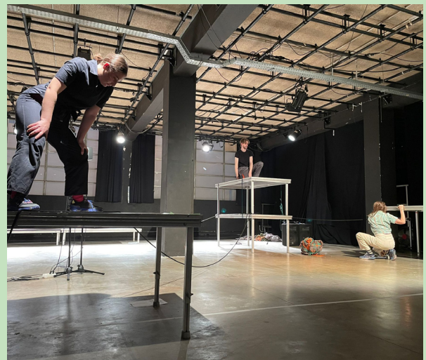
Caravan Productions (Belgique)